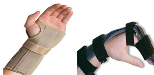
Fig. 1. Volar wrist cock-up and dorsal lock wrist hand orthosis

Patients reported their maximum pain at the start of the examination and at the end of 3 weeks after using splints