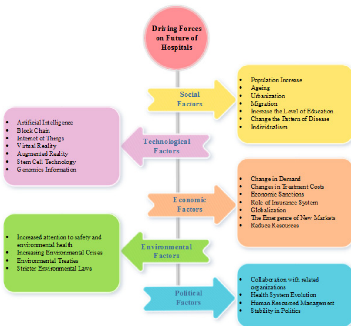
Fig. 2. Drivers of the future of hospitals