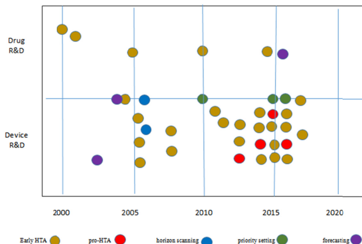
Fig. 2. Review studies presenting iterative economic evaluation in drug and medical device development, based on technology evaluation methods

made technologies. The general steps of this approach include 1. Identification: identification of emerging pharmaceutical and non-pharmaceutical technologies. 2. Filtering: Selecting the most important and most efficient technologies from the experts' point of view. 3. Priority setting: Prioritize these technologies based on different evaluation criteria from the perspective of each country. 4. Assessment: using evaluation methods for comparing two drugs or interventions in two different therapies (16).