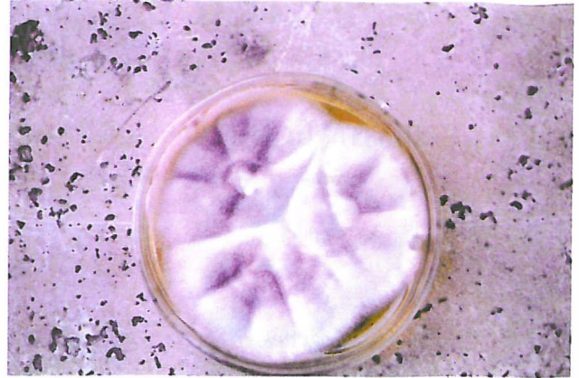
Fig. 3. Colony of Paecilomyces sp. on sabouraud dextrose agar.