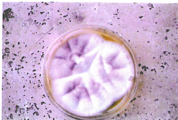
Fig. 3. Colony of Paecilomyces sp. on sabouraud dextrose agar.