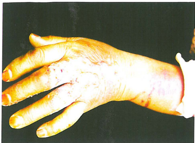
Fig. 1. Clinical appearance of the subcutaneous lymphatic abscesses.