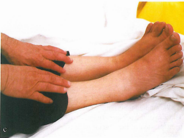
Fig.1(a,b,c). Photographs of our patient's face, hands and feet (a 14-year-old girl with congenital cutis laxa).

dation, cutis laxa, characteristic facies, cardiac failure caused by gross pulmonary emphysema, chest infections, lax vocal cords and some other clinical manifestations, along with pathological findings which totally proved that she was affected with congenital cutis laxa