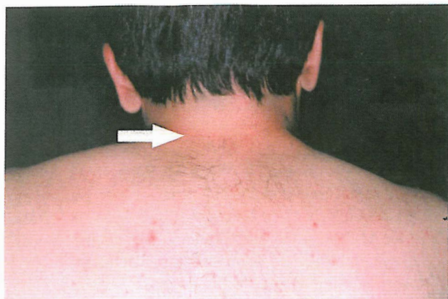
Fig. 3. Low hairline and cervical scoliosis.

0.6%, a 50% mixture of N_2O and O_2 along with incremental doses of pancuronium bromide and fentanyl. After completion of the surgery, which lasted 120 min, the patient was returned back to the supine position and residual muscle paralysis reversed with neostigmine 2.5mg and atropine 1.2mg. Extubation of the trachea was accomplished after ensuring that the patient was awake and had adequate tidal respiration. The same anesthetic protocol was again repeated 14 days later for anterior discectomy and fusion with no sequela except mild sore throat.