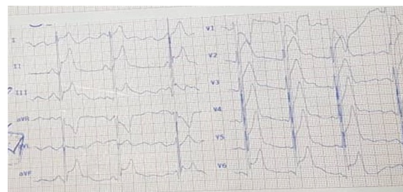
Fig. 1. The initial ECG of the patient, normal sinus rhythm, normal axis deviation, and diffuse ST elevation in lead I, II, III, aVF and V 2 to V 6

For six days, the patient was prescribed ASA 650 mg every night, and Colchicine 0.5 mg every twelve hours along with Azithromycin 500 mg stat and then 500 mg daily. Afterward, the patient was discharged completely free of symptoms with an ejection fraction of 55%. It should be noted that the patient did not develop any arrhythmias during admission. Also, he was completely