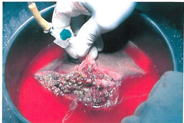
Fig. 2. Back table irrigation of left lateral segment.