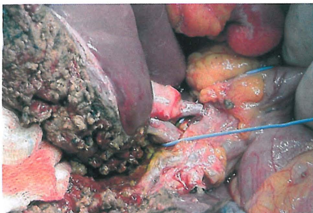
Fig. 1. Dissection and separation of left lateral segment.

Early death occurred in 2 recipients within the first month following the operation due to vascular thrombosis. Five other patients whose primary illnesses were