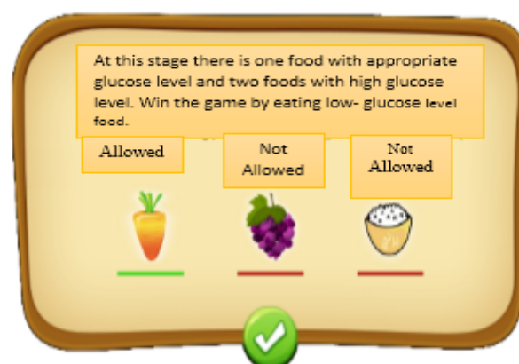
Fig. 2. Glycemic index training stage of the game