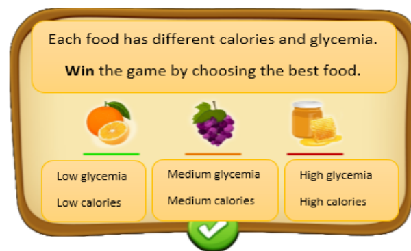
Fig. 4. Calories and glycemic index training stage (episode II) of the game

prised 14 males and 16 females with a mean age of 44.13. There were no significant differences between the mean age of the two groups ( p > 0.05 ). The mean duration of diabetes was 32.20 and 39.83 in the intervention and con-