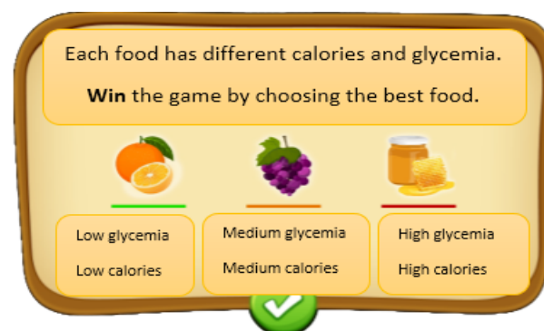
Fig. 4. Calories and glycemic index training stage (episode II) of the game

prised 14 males and 16 females with a mean age of 44.13. There were no significant differences between the mean age of the two groups ( p > 0.05 ). The mean duration of diabetes was 32.20 and 39.83 in the intervention and con-