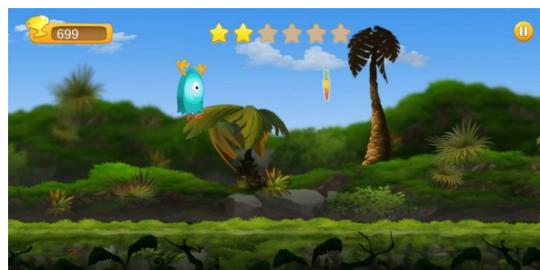
Fig. 3. The episode I of diabetic Amoo mobile game