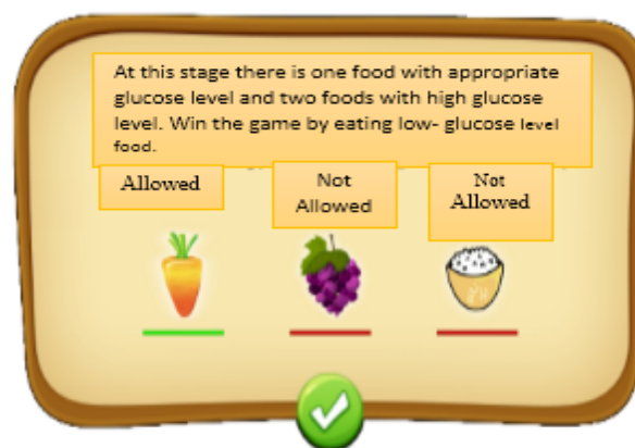
Fig. 2. Glycemic index training stage of the game