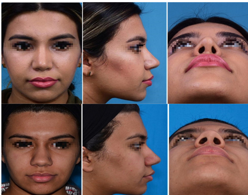
Fig. 2. A) .Patient with thick skin before surgery (first row). B) One year after rhinoplasty with nasal tip defatting (second row)