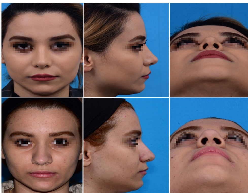
Fig. 3. A) Patient with thick skin before surgery (first row). B) One year after rhinoplasty without nasal tip defatting (second row)

comparing pre- and post-operative photos using the visual analog scaling (VAS) method 12 months after the operation. Additionally, patients' satisfaction was assessed by VAS scoring, in which 0 corresponded to the absence of satisfaction and 10 represents the perfect satisfaction with the result (Figs. 2 and 3).