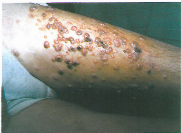
Fig. 1. Zosteriform metastases in a 69-year-old man with malignant melanoma.