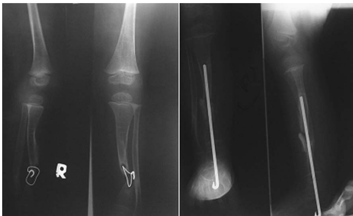
Fig. 1. Case 2: A patient with an early onset congenital pseudoarthrosis of the right tibia who was first treated unsuccessfully with wiring in Afghanistan. Preoperative and postoperative x - ray after IM rod fixation was performed.