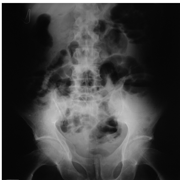
Fig. 2. Distended intestinal loops in plain abdominal X ray.

of larvae. Lung migration may cause cough, dyspnea, fever, hemoptysis [1], and peripheral eosinophilia. Our patient did not have any cutaneous manifestations or frank eosinophilia.