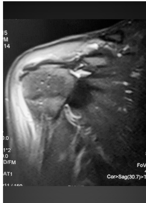
Fig. 1. MRI of 37 y/o female with Rt shoulder pain since 5month ago who was treated as bursitis

Calcifying tendinitis is a prevalent upper extremity disorder at the age of around 40 years, mostly in women. It could be associated with debilitating pain and complaint of restricted shoulder movement. A mix of plain radiographs and MRIs should be used to make the diagnosis, as an MRI alone could lead to a misdiagnosis. Furthermore, in a sig-