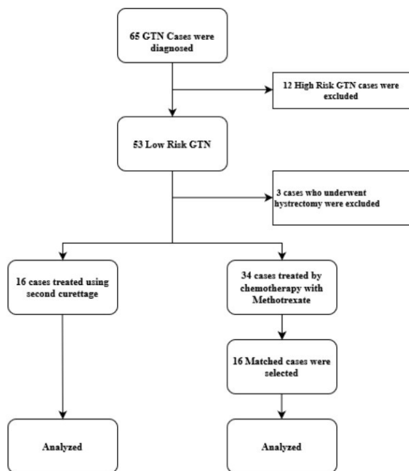
Figure 1. Patients' flowchart

GTN is diagnosed based on these criteria: 1) a rise in the \beta hCG assay of 3 consecutive measurements, or longer over at least a period of 2 weeks or more; days, 1, 7, 14"; or 2) "a plateau in the \beta hCG assay for four consecutive weekly levels over three weeks or longer; that is, days 1, 7, 14, 21"; or 3) the \beta hCG level remains detectable for six months or longer; or 4) histological diagnosis of choriocarcinoma.