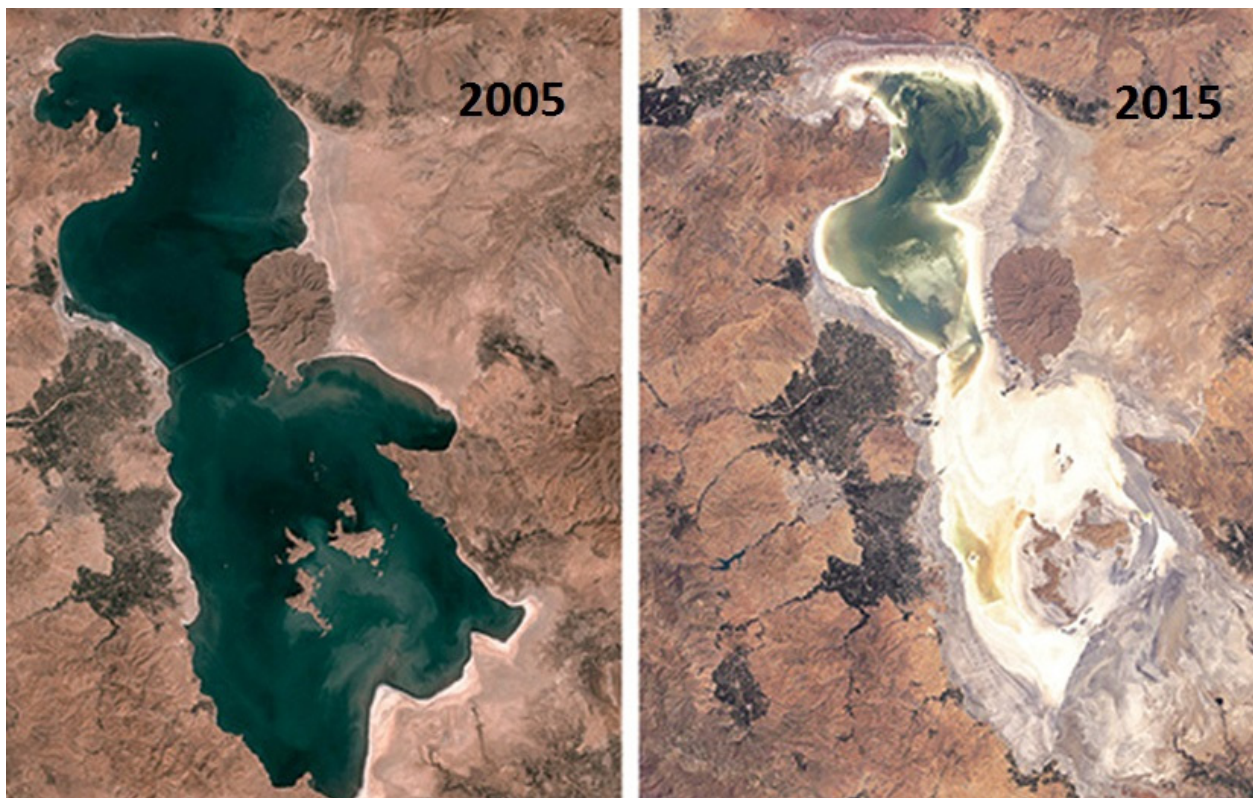
Fig. 1. Image of Lake Urmia before and after drying up (21)

In addition to environmental, ecological, socioeconomic, and security effects, LUD could, directly and indirectly, affect human health. Many environmental experts believe that LUD has irreparable consequences for provinces as well as neighboring countries (20). It is estimated that more than 13 million people will be affected by LUD (21, 22). Regional climate change from temperate to tropical, changes in the region's ecosystem, water shortage, reduced agricultural period, decreased fertility of agricultural lands, and reduced number of tourists entering the region, and the resulting irreparable economic losses will lead people to migrate and all these factors will have an indirect adverse impact on health (20). Moreover, LUD increases salt dust, chemicals, and heavy metals suspended in the air due to wind (23, 24). Due to the entry of industrial and agricultural effluents into the lake and their