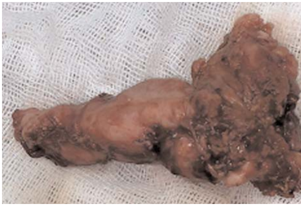
Fig. 3. Grossly, the mass was in cylindrical shape (7×2×2 cm) in position of right vagus nerve.