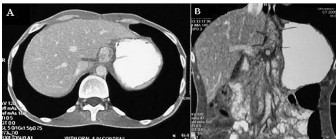
Fig. 2. Enhanced computed tomographic (A) axial scan and (B) coronal scan reveal a mass parallel to esophagus.

The patient's symptoms recovered after surgery; there was no sign of delayed gastric emptying. Three months after surgery, patient gained 16 kg weight with feeling of wellbeing and returned to his normal social activities. One year after surgery the patient had normal status with 25 kg weight gain.