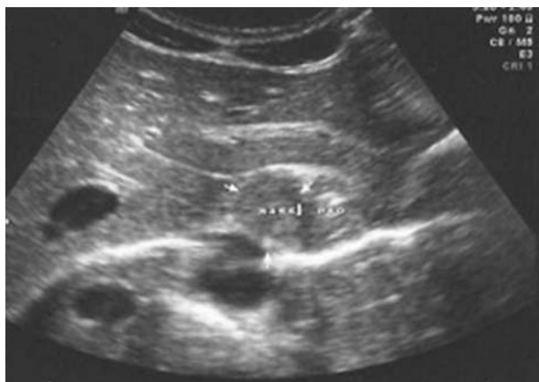
Fig 1. Sonographic finding showing a hypoechoic mass adjacent to abdominal esophagus.

structive lesion. After repeated assessment of gastrointestinal tract, he was then referred to psychiatric department for more evaluations. The patient was inaccurately diagnosed for anorexia nervosa and treated with multiple psychiatric drugs for three years with no improvement in site. The patient lost his work because of generalized weakness.