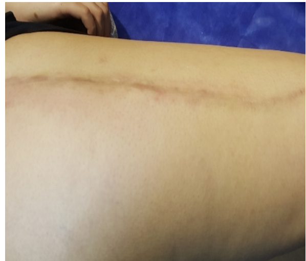
Fig. 1. The postoperative scar after right THA

Physical examination showed that both surgical areas