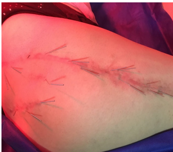
Fig. 2. DN of the scar in the right hip

adhesion. The therapist placed other needles (0.25 x 25 mm, Dong Bang Acupuncture Inc., Kyunggi-do, Korea) above the proximal border of the scar band at a 15 to 30 degrees perpendicular to the tissue surface in a vertical line and gently rotated the needles back and forth. In addition, infrared radiation was applied for 20 minutes at a distance of 40 cm from the patient's body to improve regeneration and facilitate scar tissue regeneration (Fig. 2). Needles were manipulated and rotated 2–3 times during the session. Treatments were performed twice a week for 3 continuous weeks with 30 minutes each time.