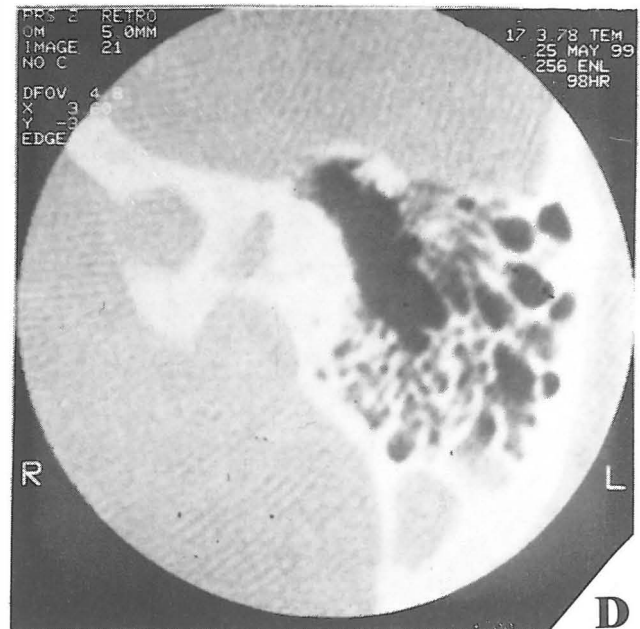
Fig. 2. Examples of observed inner ear abnormalities in the patient group's CT scan. a: vestibule abnormality, b: vestibule and LSCC abnormalities, c: cochlear hypoplasia and LVA, d: vestibule, LSCC and cochlear abnormalities and extreme LVA.