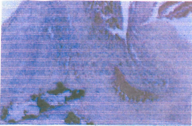
Fig. 2. High-power photomicrograph shows that the A-V fistula has vessels that are thickened and hyalinized and a fibrotic stroma with focal calcification.

A wedge liver biopsy showed dilated and congested centrilobular veins (Fig. 3).