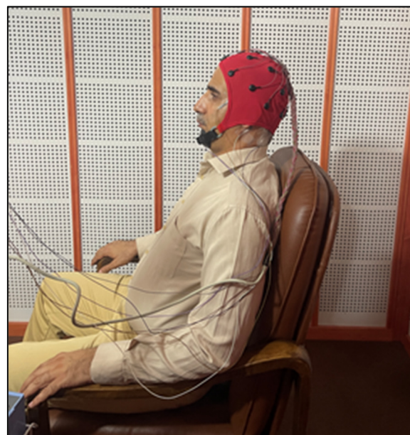
Figure 1. Participants resting state position with eyes open

For the active lumbar forward flexion movement, participants were standing in a relaxed position with their feet