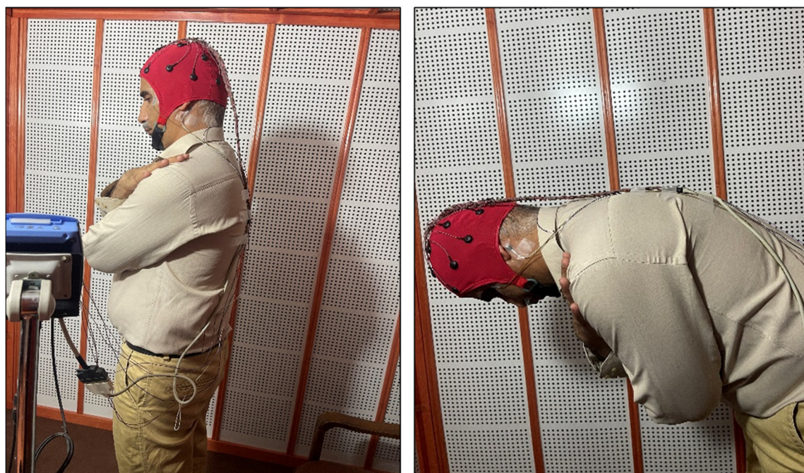
Figure 2. Test position for active lumbar forward flexion. (a) starting position. (b) active lumbar forward flexion

formed from the time domain to the frequency domain, using fast Fourier transformation (FFT), yielding power spectra. A fast Fourier transform (FFT) was computed with a 1-second Hamming window and the window was shifted with 50% overlap (Welch method). Then, the absolute EEG power spectra estimate was obtained by taking the average magnitude of Fourier coefficients of each trial and five frequency domains were extracted in delta (1–3.9 Hz), theta (4.0–7.9 Hz), alpha (8.0–13.9 Hz), beta (14.0–34.9 Hz), and gamma (35–50). The relative power of each frequency domain was computed by dividing the absolute power at each frequency by the total power across all frequencies. The absolute and relative (percentage of total EEG power) EEG power spectra density was measured at the following frequency domains delta, theta, alpha, beta, and gamma at prefrontal, frontal, parietal, temporal, and occipital electrode locations (the electrode locations for each brain region are summarized in Table 2). The same processing was used for resting-state and forward flexion EEG signals. Further, values for each electrode location were also statistically analyzed to yield spatial information on brain activity.