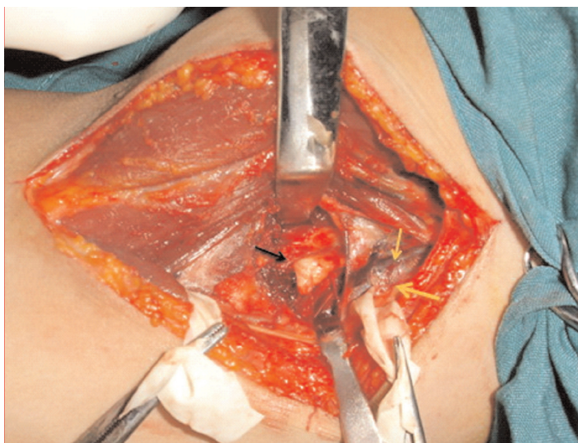
Fig. 3. Intraoperative finding of the supracondylar process (black arrow).

bicipital sulcus, we identified the median nerve and followed it as it and the brachial artery passed under Struthers' ligament (Fig. 2 and Fig. 3). Struthers' ligament was identified as a thick and firm broad fibrous band running from the apex of the supracondylar process to the distal and medial arm, where after 4 cm it was inserted to the medial epicondyle of the humerus. The median nerve did not show any signs of compression. Before the excision of Struthers' ligament and the supracondylar process, functional testing was performed. With full extension of the elbow and forearm pronation the median nerve stretched over the process. Struthers' ligament and the supracondylar process were removed entirely. The symptoms were relieved after operation and the patient was able to return to his previous job after 12 weeks of postoperative therapy.