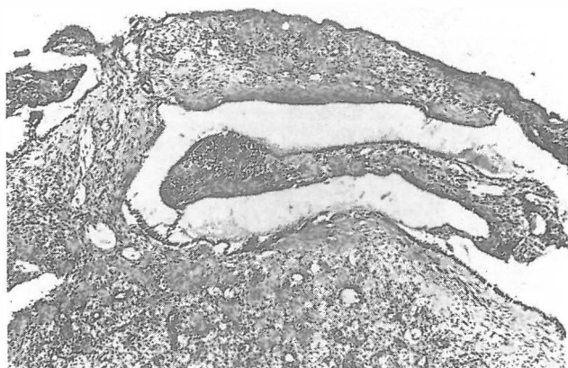
Fig. 1. Inflammatory aural polypous tissue stained with hematoxylin and eosin ( \times 135 ). The stroma showed various degrees of edema, fibrosis, increased vascularity and infiltration by plasma cells and lymphocytes.