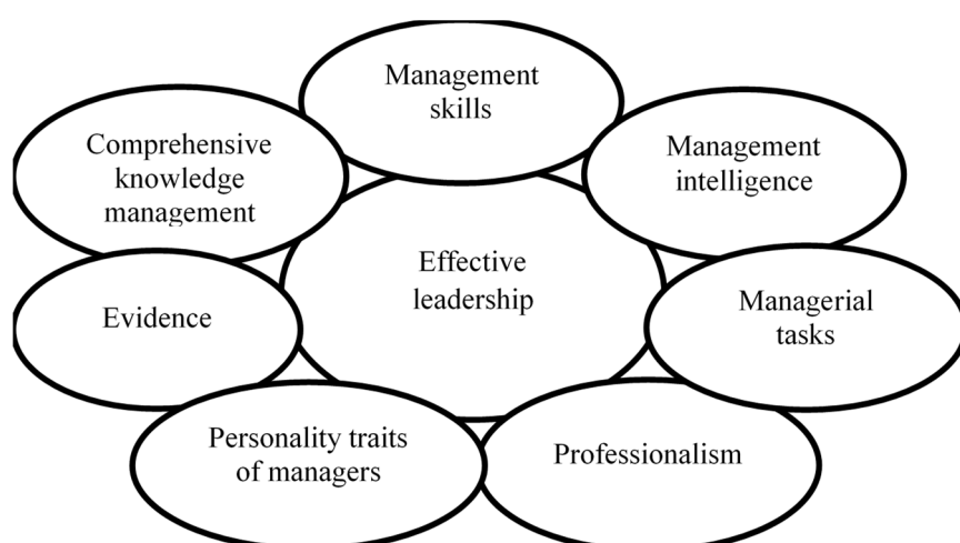
Figure 2. Final Model for Competency and Meritocracy of Hospital Managers

form of specialization, work ethics, and personal ethics, concluding that the presence of professional managers in