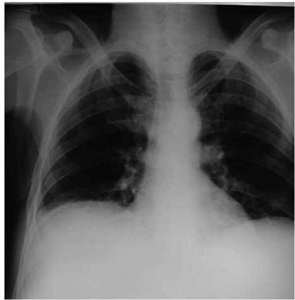
Fig.1. CXR no evidence of lung cyst

Physical Examination at admission showed a fully conscious middle-aged male with an oral