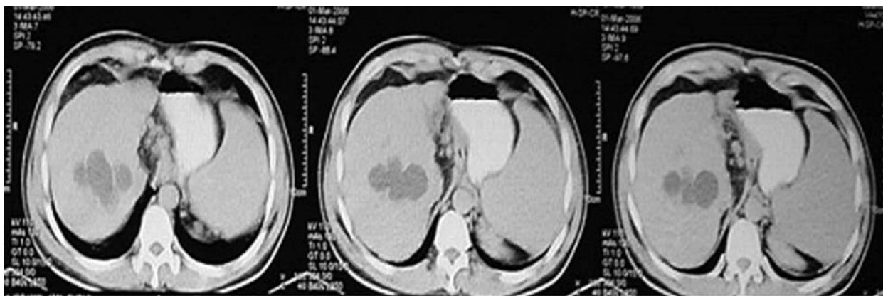
Fig.5. Cyst in liver with reaction around the cyst suggested rupture.

dilated CBD (13mm), containing sludge debris and multiple cystic images without acoustic shadow, which may represent daughter cysts. In addition, the serology test for hydatid cyst antibody (IgG) was positive. These findings raised a very high suspicion of frank intrabiliary rupture of hydatid cyst, which was ignored. When INR reached 1.4, ERCP and sphincterotomy were done and the findings showed multiple irregularly-shaped filling defects in the CBD and a round cystic lesion which was may communicated with the biliary system, with mild distal stricture and dilatation of intrahepatic ducts. The comprehensive information provided by ERCP, presented conclusive evidence of the presence of daughter cysts in the CBD, demonstrated the cystobiliary fistula and above all,