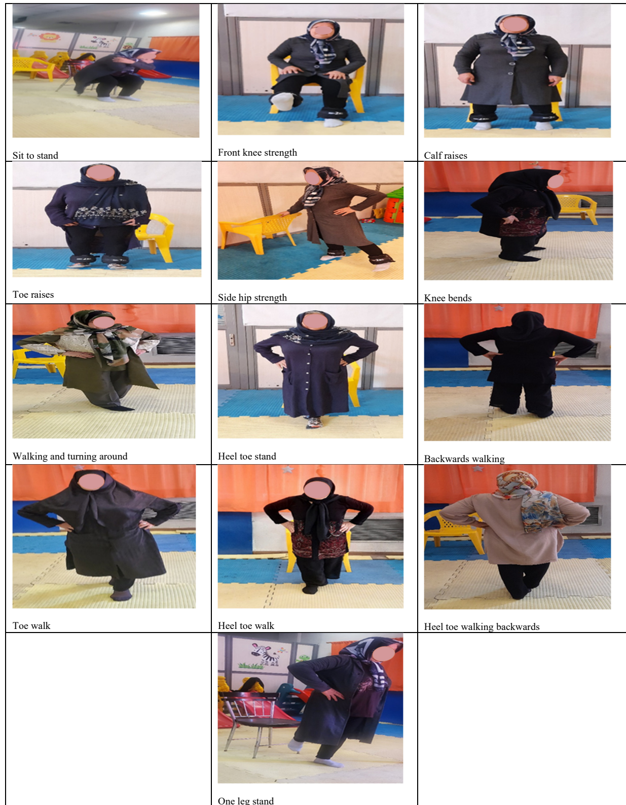
Figure 2. Otago Exercise Program

The standard OEP included exercises such as Sit-to-stand, Front knee and side hip strengthening, Calf and toe