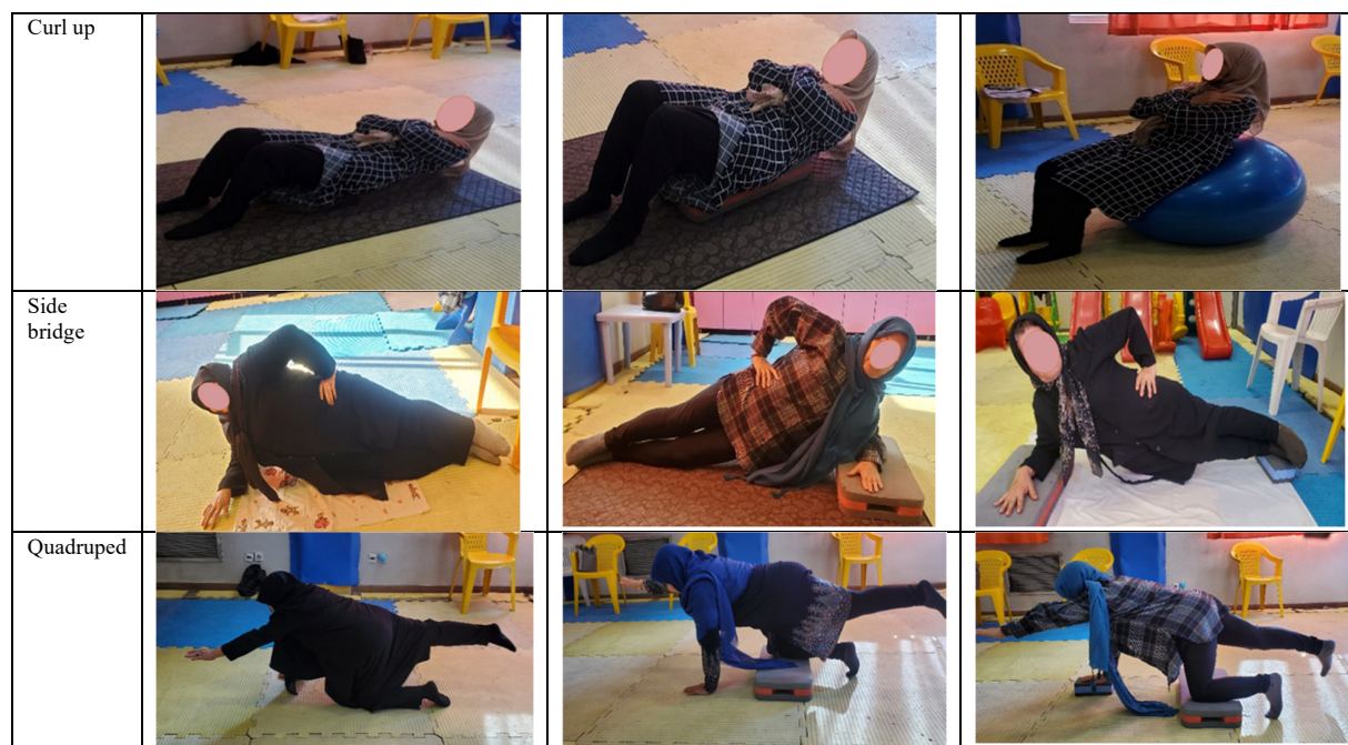
Figure 3. Core stability Training

Timed Up and Go (TUG) test scores, reflecting both fall risk and dynamic balance, showed a statistically significant group effect ( F(2, 26) = 25.7 ; P < 0.001 ; \eta^2 = 0.497 ). Post hoc comparisons indicated that the Modified