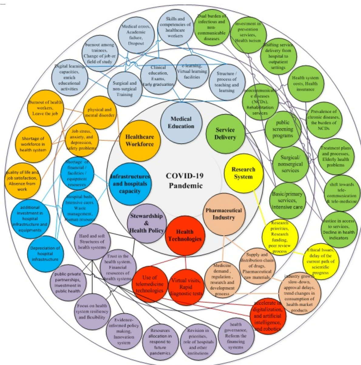
Fig. 3. Effects of the COVID-19 on the different dimensions of the health system