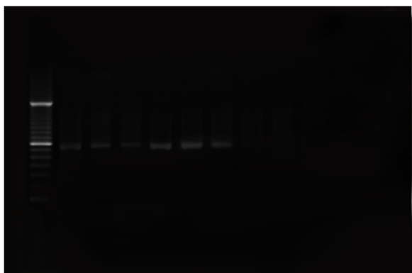
Fig. 1. Amplification of the ipaH gene. Lanes: 1, DNA molecular size marker (100-bp ladder); 2-7, Crohn's disease samples; 8, negative control (Water).