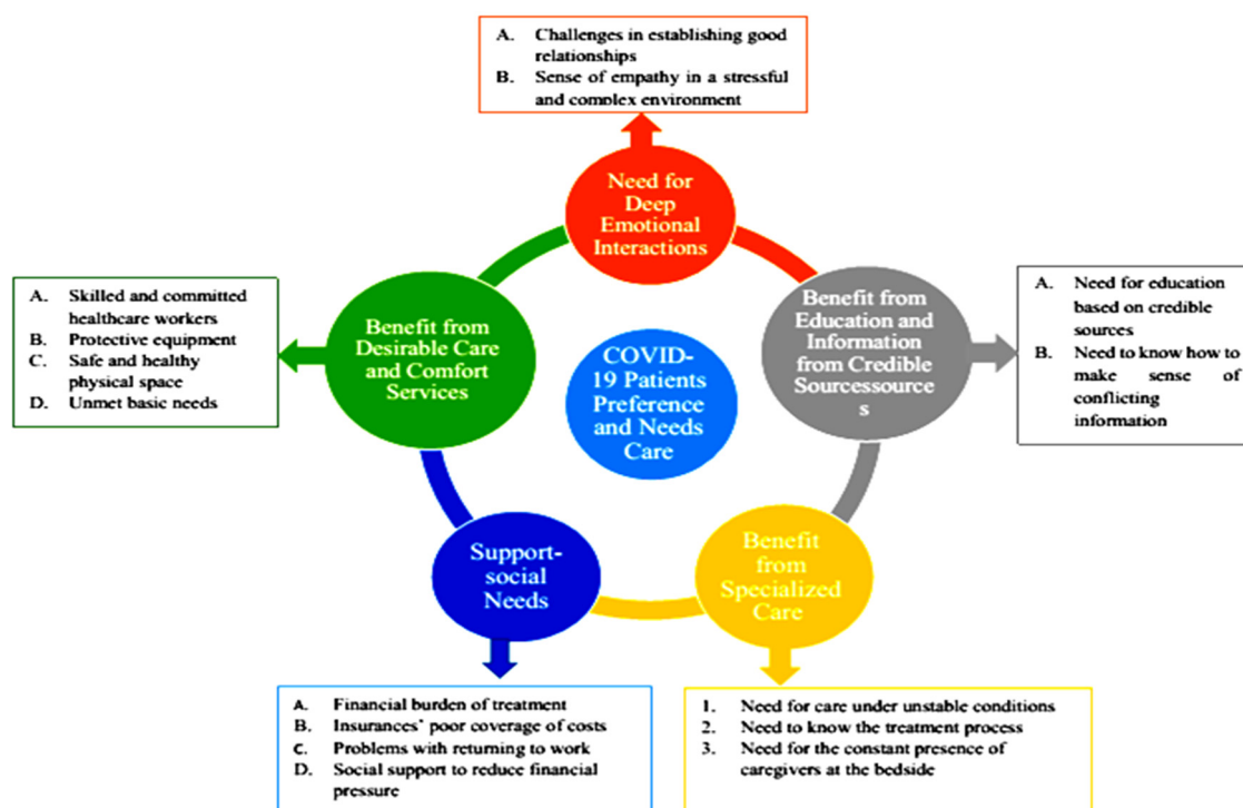
Diagram 1. Five categories of needs and preferences from perspective of COVID-19 patients

Having a sufficient number of health care workers to meet the treatment and care needs of patients is extremely